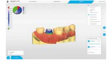
Analysis software For objective assessments