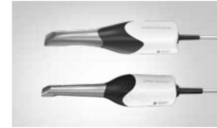
CEREC Primescan and CEREC Omnicam For optical surface scans