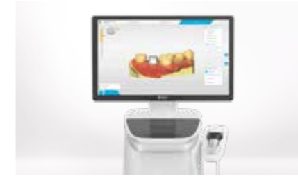
CEREC AC The mobile computer unit